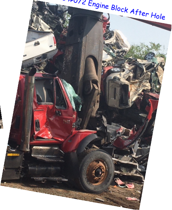
Vehicle #072 Engine Block After Hole

Note to self: Get the information off the truck before commencing crushing